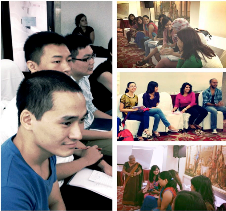
Figure 2: Session On Interpersonal Communication

The session helped them dissect the components of effective communication, and then practice various techniques through exercises that simulated various tense, embarrassing and delicate situations that an SRHR activist might find themselves in.