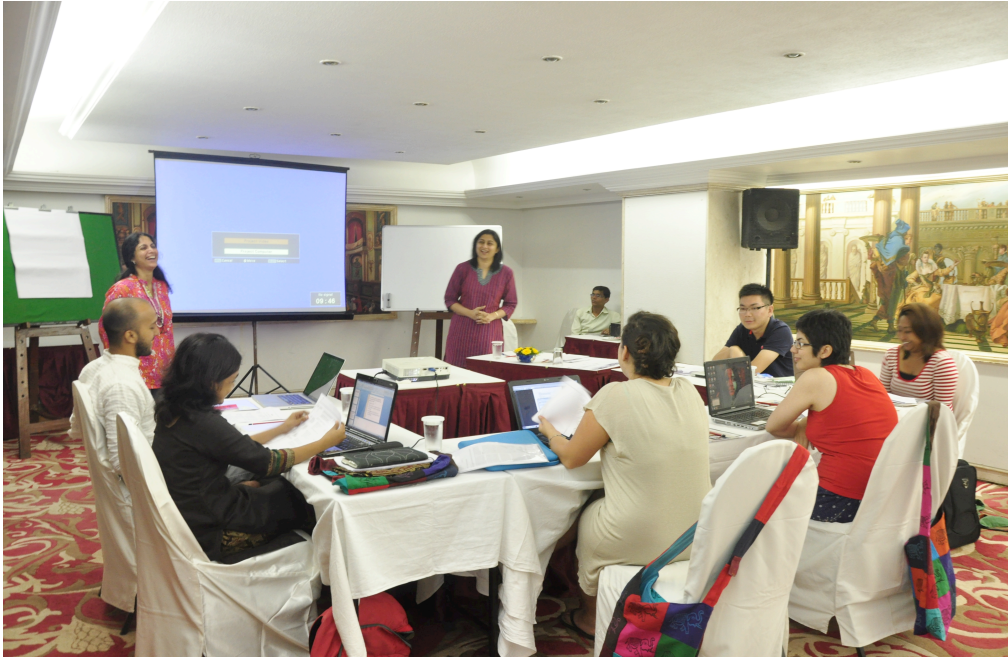
Figure 1: A reunion at the Refreshers Summary of The Institute:

The four youth champions selected for small grants presented reports of their projects before the ASAP Staff.