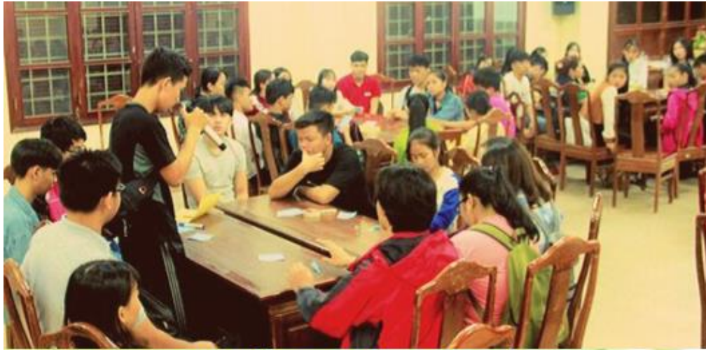
small group rounds