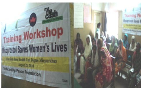
[Banner and Participants of Training Workshop]

America. This hotline will put life-saving information directly into the hands of the women who need it.